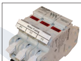
Continuous marking strip and adaptors

* USCMA required for use with USCM0 and USCM1