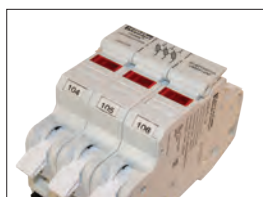
WMB Marker System