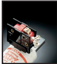
AOS-S Mounted on fuse